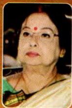
Smt. Madhabi Mukherjee [Lifetime Achievement] (Renowned Actress)