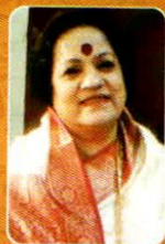
Smt. Haimanti Shukla (Noted Singer)